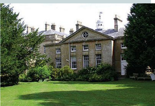
Newton Park Campus, Bath Spa University